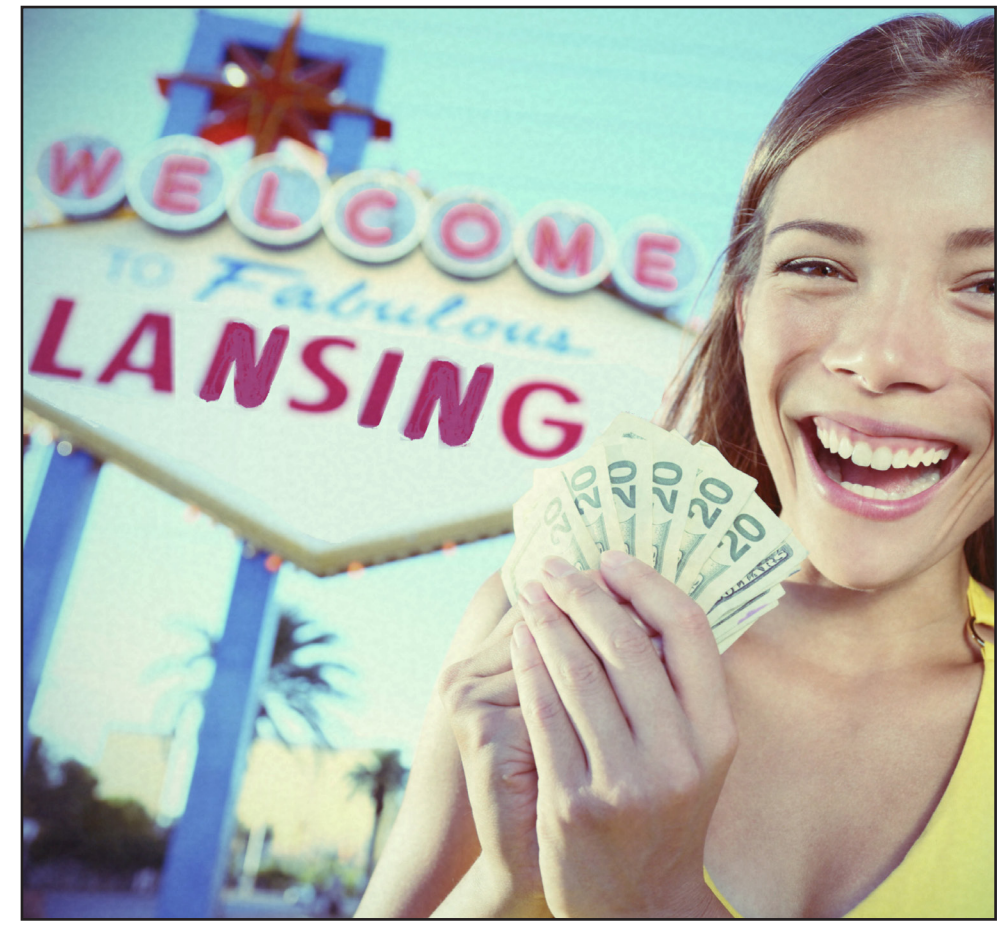
The city that will never sleep: "You thought downtown was hopping before, you just wait!"

In the plan, that will be designated as a reserva-