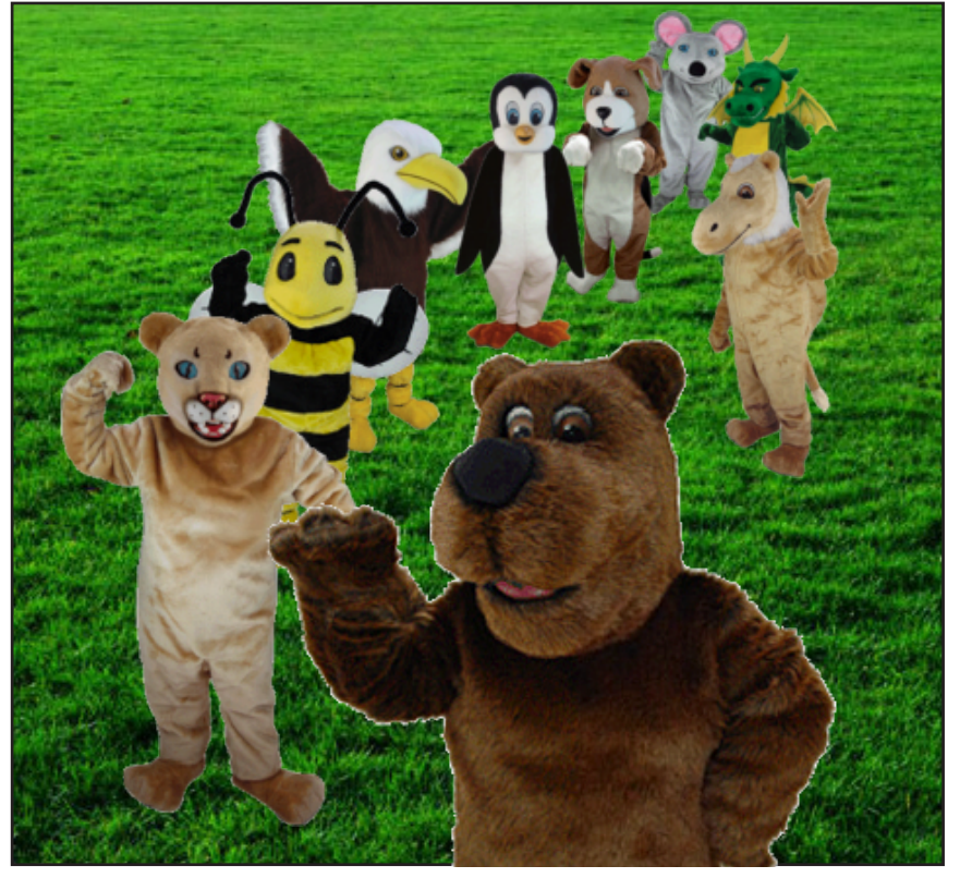
What does the fox say? "The fox is a squirrely little dude who doesn't say much, actually..." according to Bernie Nero, the bear.

"Looking at this, you would get the distinct impression the tiger is some kind of ... predator at loose in the jungle." When a reporter pointed out that tigers are jungle predators, O'Clysm, replied: "Maybe, but that's only one side of them; have you ever