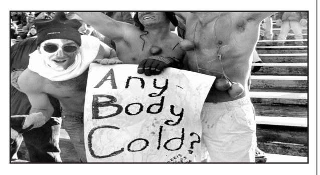
Spartving on in the stands: Despite dropping temps, a group of Spartans refused to leave the stadium.