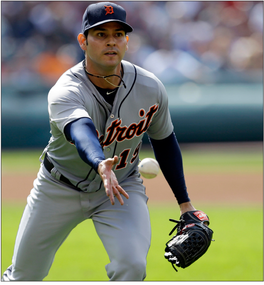
"My stats are going to plummet, " said one unnamed major league pitcher. "An slice to give it that rec softball feel. 8-year-old could do this. How do you throw a fastball now?"

Officials said they expect game times will likely increase to about five to six hours, giving it that old-fashioned double-header feel, while fans will be invited to join players after the game at local watering holes for a beverage and a