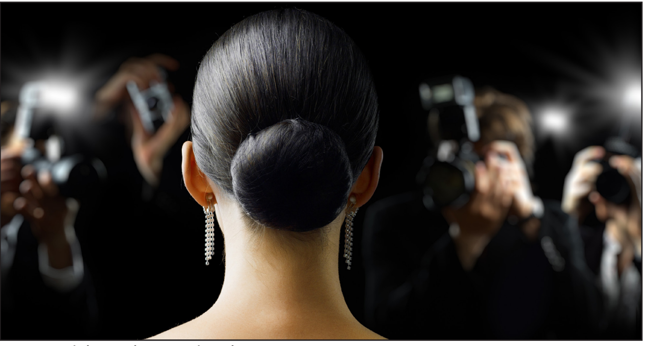
We're not entirely sure why we're trying to keep up.

And lately, she's been drawn to a hunky werewolf; being upper-class