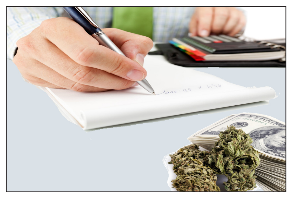
Marijuana advocates can find themselves in a taxing situation.