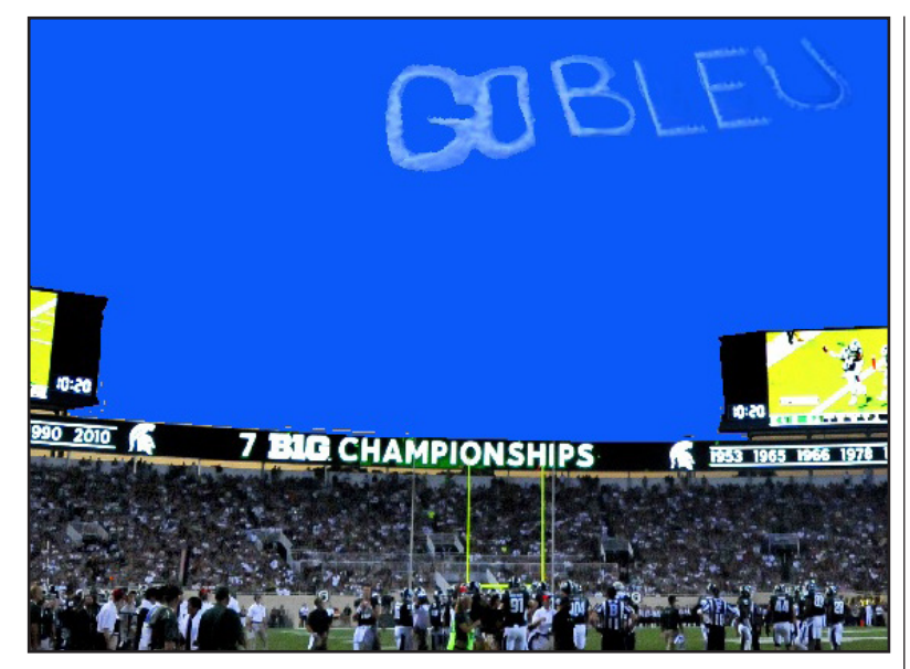
Nothing but Bleu Skies from here on out.

"I'm not sure, but it worked," he said while resetting his U-M countdown clock to next year's game. There was no official comment from the losing school, although one player, as he left the field, was heard to be muttering, "Big bullies."